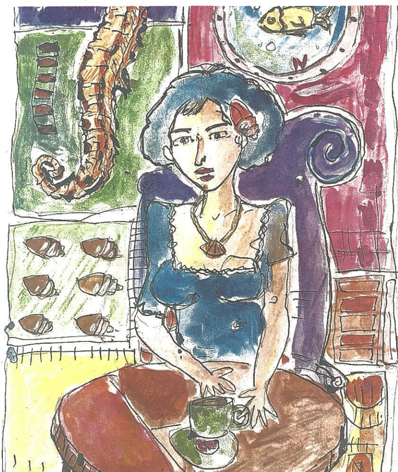
16 asylum seekers and refugees took part in workshops at ZSL then developed their artworks at the New Art Studio in Islington