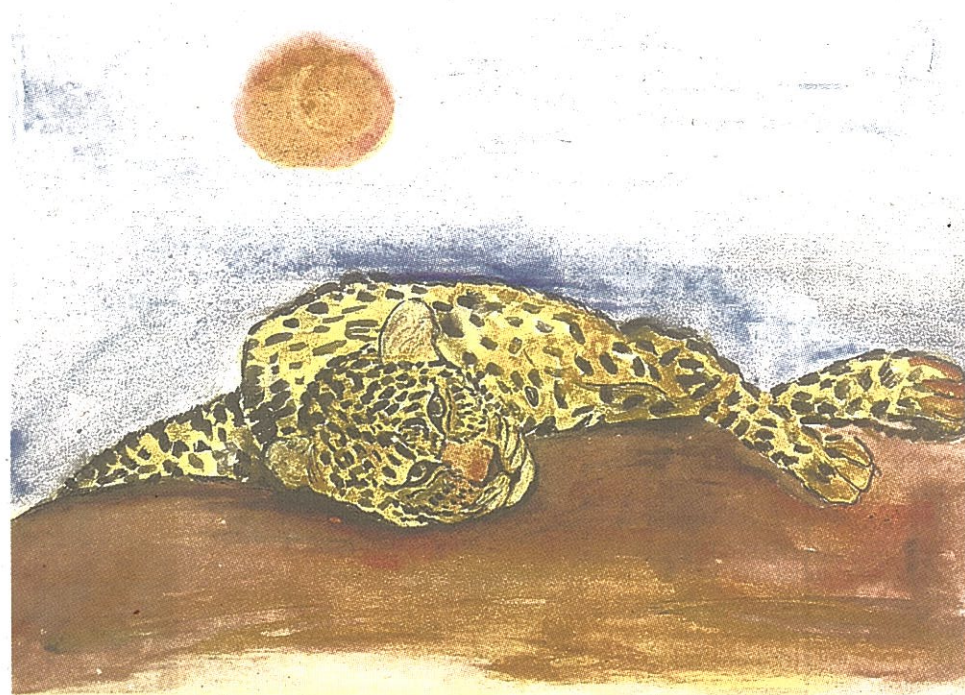
Refugia saw asylum seekers creating artworks after workshops at London Zoo

Refugia is on show from February 19 at the Huxley Lecture Theatre in the Outer Circle, Regent's Park. www.eventbrite.co.uk/e/refugia-exhibition-tickets-522362930587