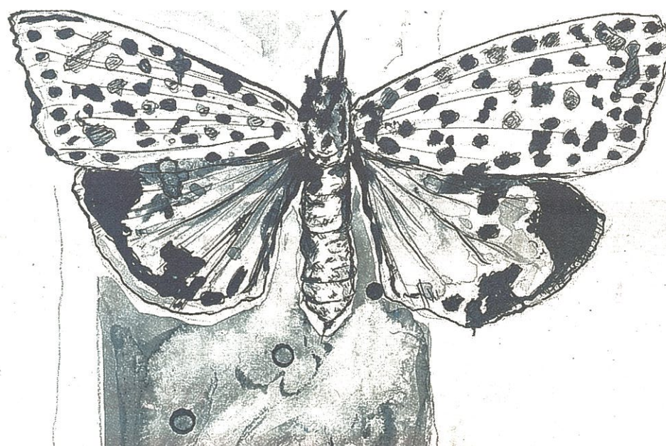
Each workshop was based around a conservation topic and an artistic technique